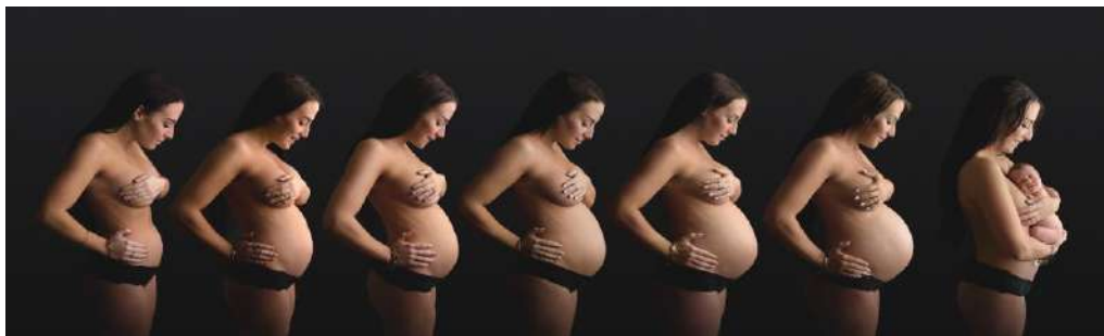
Sample Preggy Panel (mom delivered at before her 36-week appt)