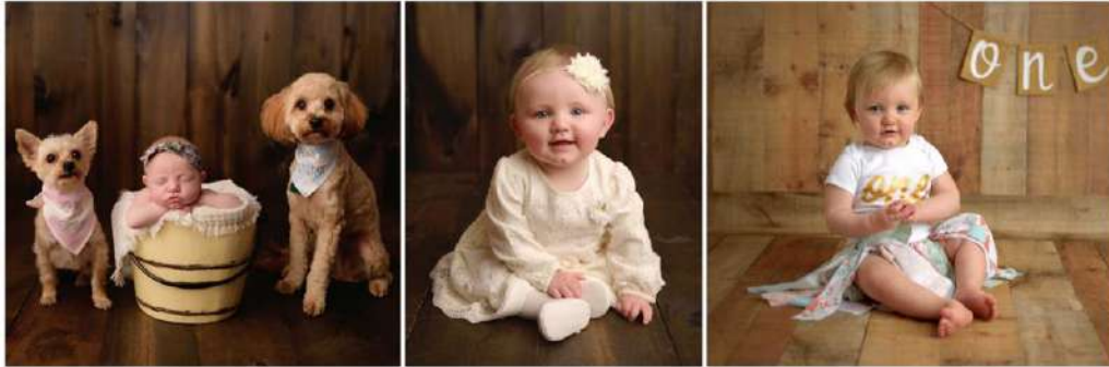
Watch Me Grow